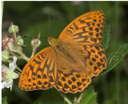
Silver-washed Fritillary

Despite the poor weather I was able to show the 19 people who came the good spots to look for Silver-washed Fritillary and White Admiral. Both had a good season in this wood, with more than a dozen sightings of SWF here at different dates up to mid August. A two-hour circuit of the wood succeeded in disturbing a few other damp looking butterflies.