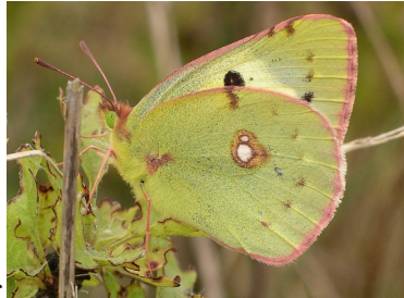
Clouded Yellow

But in possibly the most exciting end to the butterfly flight season for many a year, has been the appearance of many migrants and their progeny in our area. It all began in July when it was apparent that a large number of newly hatched Painted Ladies were emerging. The PLs are particularly pretty when fresh and have a beautiful pink flush colouration for their first few days from which their name derives. Then, in August the Clouded Yellows began to appear and we were very lucky in our county to have a hot-spot at Bunkers Park LNR Hemel Hempstead where a small family group took out temporary residence. I personally saw three CYs in one week one being a female helice variation [this in Bedfordshire], and this sighting gave me great satisfaction.