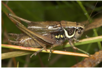
Roesel's Bush Cricket

Chalkhill Blue was the main target species for this trip. A small number had been seen at the site in 2005 after an absence of several years.