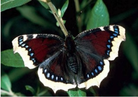
Camberwell Beauty